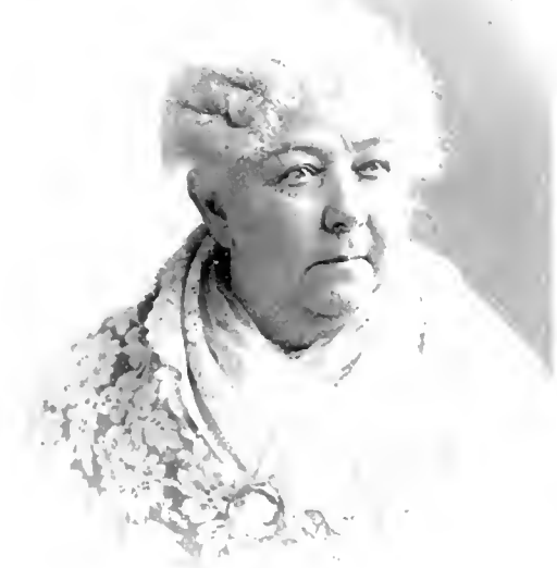
ELIZABETH CADY STANTON.